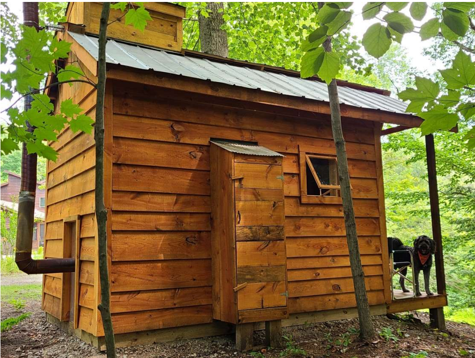
Wood bin with door for easy loading!