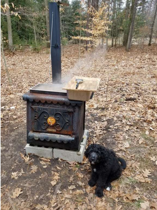
Old Outside evaporator

Our setup for this was an old woodstove with one boiling pan and a warming pan. I cut the top out of the stove so the pan was exposed to the fire. The pans were quite small and we could boil about 3 gallons of sap per hour. Also, this setup was located outside and the spring weather could be cold, wet, and windy at times.