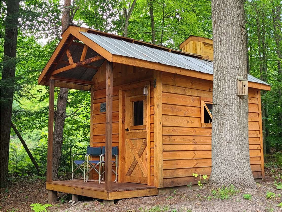
Shack is 8' x 16' including the porch