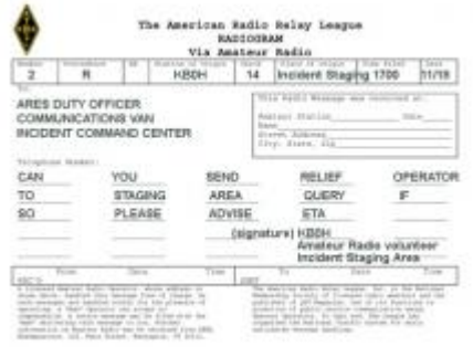
My second effort at a practice message.

That particular assignment changed everything for me. First, I had to get my fledgling HF efforts moving along so that I could reach a traffic net. And second, I had to figure out just what formal traffic was.