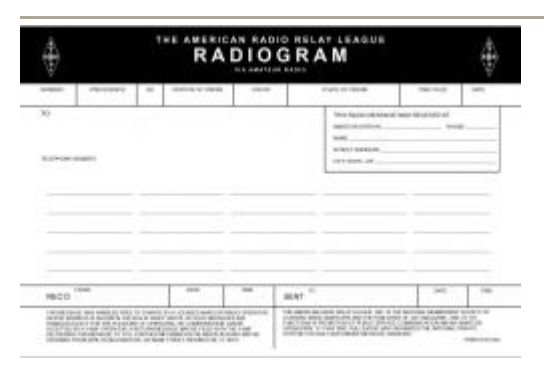
This is the original ARRL radiogram form.

Some years ago when I took the ARECC (Amateur Radio Emergency Communications Course). I discovered an aspect of the hobby of which I'd been unaware: Formal traffic. One of the exercises in the course said that I should compose a formal message and then send it to my ARRL Section Manager.