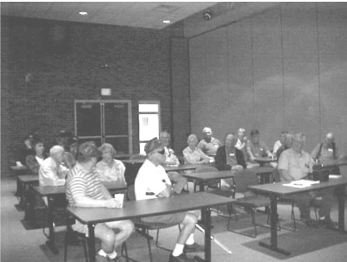
THE CROWD TAKES IN ALL THE ACTION